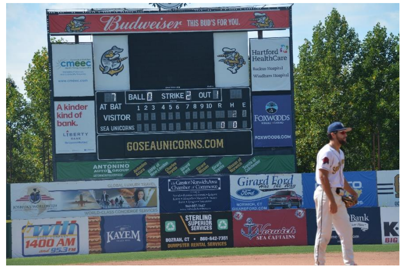
MESSAGE BOARD SIGN WOULD BE DISPLAYED SEVERAL TIMES THROUGHOUT THE GAME!

AS THE SPONSOR FOR A GAME, YOUR COMPANY WOULD HAVE THE OPPORTUNITY TO GIVE AWAY AN ITEM WITH YOUR LOGO (AND THE SEA UNICORNS LOGO) TO HELP RAISE AWARENESS OF THE BRAND!