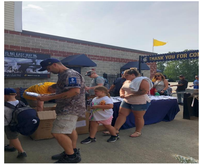
FANS ARE ALWAYS EXCITED TO RECEIVE A CO-BRANDED GIVEAWAY WHEN ENJOYING A GAME!

“LADIES AND GENTLEMEN, TONIGHT’S GAME IS SPONSORED BY YOUR COMPANY! YOUR COMPANY’S MESSAGE! THANK YOU YOUR COMPANY!”